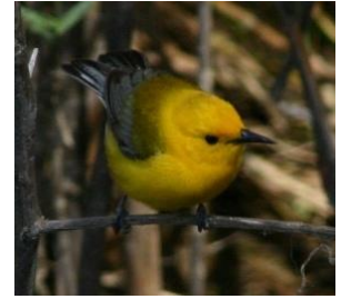
Prothonotary Warbler