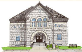
DICKINSON MEMORIAL LIBRARY

THE NEW ENGLAND CENTER FOR CIRCUS ARTS (NECCA) PRESENTS A STUDENT DEMONSTRATION SHOW FEATURING ASPIRING PERFORMERS FROM THE SCHOOL'S INTERNATIONALLY RECOGNIZED PROFESSIONAL TRAINING PROGRAM ALONGSIDE ADVANCING COMMUNITY STUDENTS. THE BRATTLEBORO BASED NATIONAL EDUCATION CENTER OFFERS RECREATIONAL AND PROFESSIONAL CLASSES FOR ALL AGES AND ALL LEVELS. BE AMAZED AND ENTERTAINED AS THEY SWING, LEAP AND FLY PRESENTING ACROBATICS, JUGGLING AND AERIALS. WWW.NECCAFORCIRCUSARTS.ORG TWO SHOWS: 10:30 AM & 11:30 AM