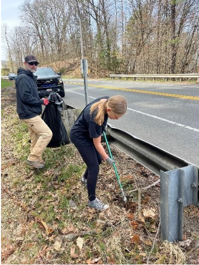
"Clean Up With the Cops" hosted by Northfield PD

On Saturday, April 27 th the Police Department held "Clean Up with the Cops" to support clean up efforts in the Town, for Earth Day.