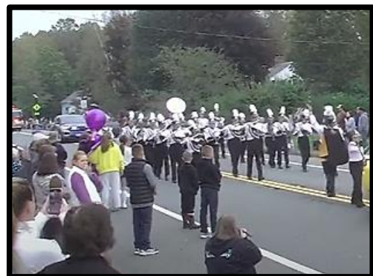
PVRS Marching Band