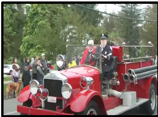
Antique Northfield Fire Engine

2023 isn't over yet! To learn about what's next in this exciting year of events, visit the 350 th Anniversary Committee's website or check out the list of events later of page 7 of this newsletter.