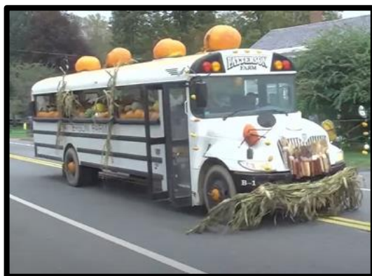
Patterson Farm Pumpkin Bus